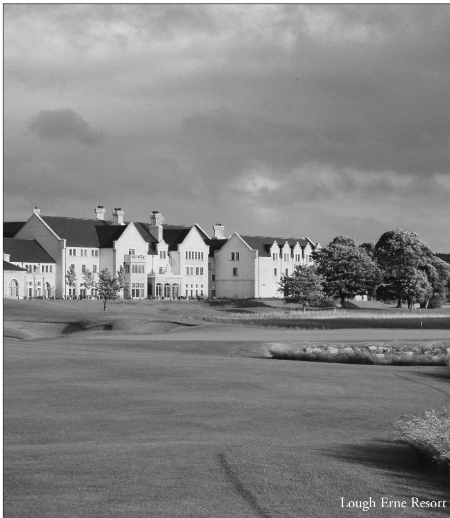
Lough Erne Resort

We've taken some time to mention the best-known professional golfers from Northern Ireland – Darren, Rory and Graeme. However, there is another